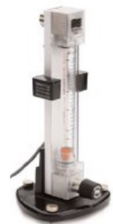
NGXV with alarm sensor (GIR) and bench stand

For further information, please ask for the separate data sheets.