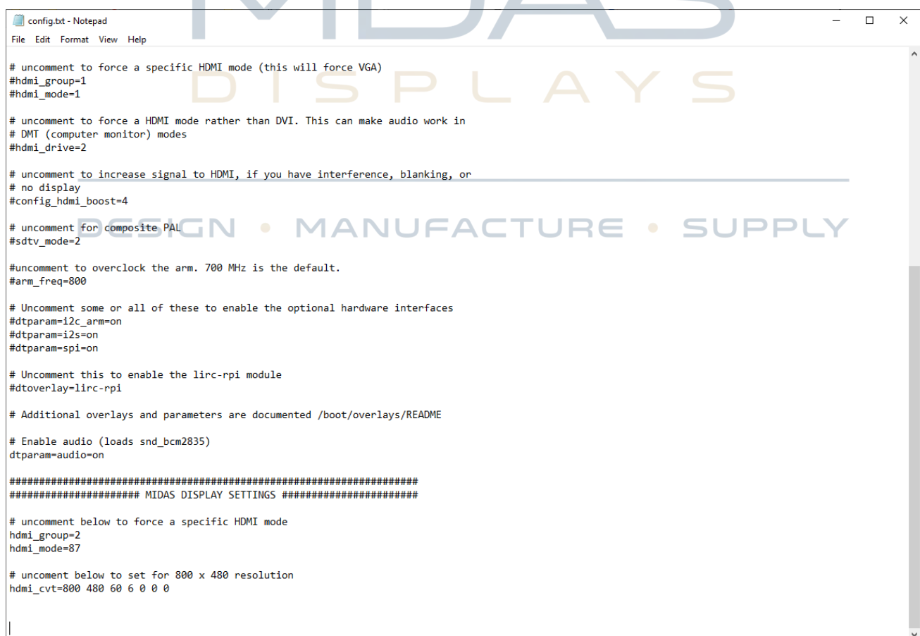
FIGURE 3 - EXAMPLE OF A CONFIG FILE