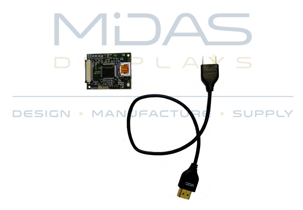
FIGURE 1 - MDIB-11 (LEFT) & HDMI CABLE (RIGHT)