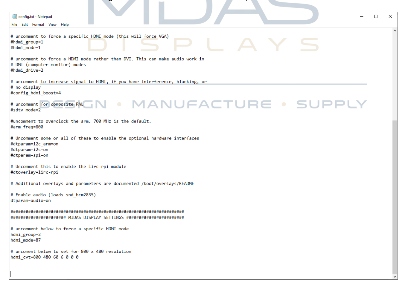
FIGURE 3 - EXAMPLE OF A CONFIG FILE