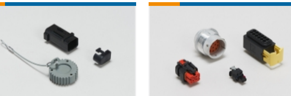
Automotive Connector Caps & Covers (32)