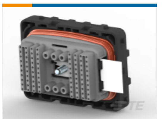
TE Part # DRCP28-86SB PLG, 86P, BLK, 12/20, B