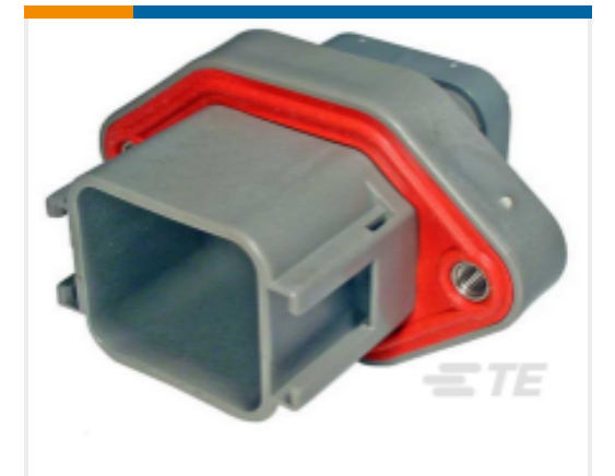
TE Part # DTV02-18PA REC, 18P, GRY, N, FLANGE, A