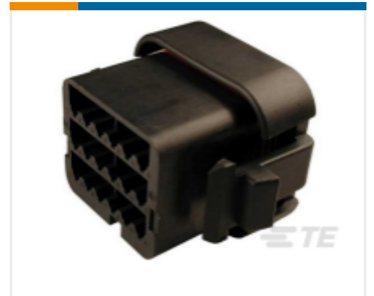
TE Part # DTV06-18SB PLG, 18P, BLK, N, B