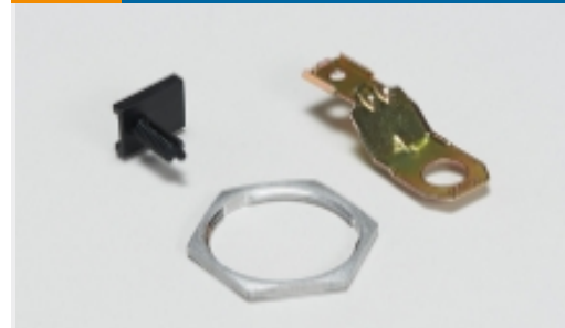
Other Automotive Connector Accessories(6)