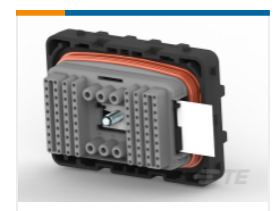
TE Part # DRCP28-86SC PLG, 86P, BLK, 12/20, C