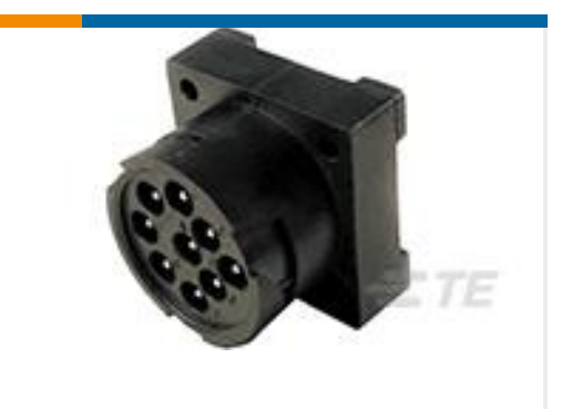
TE Part # HD10-9-96P-N005 SQ FG REC ASM