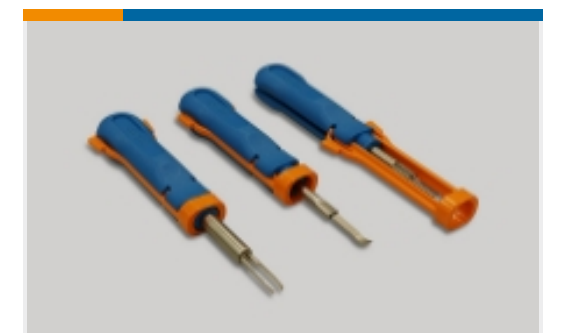
Insertion & Extraction Tools(10)