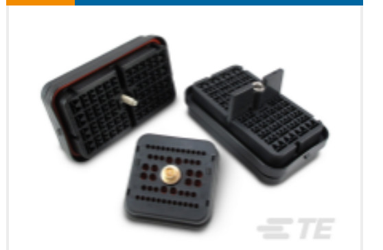
TE Part # CAT-D781-CH8172 DEUTSCH DRB Housings