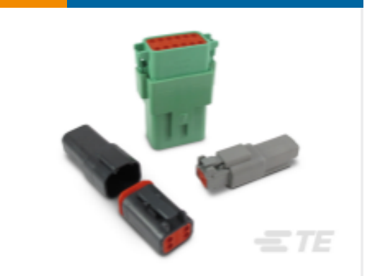
TE Part # CAT-D487-CH8172 DEUTSCH DT Series Housings & Connectors