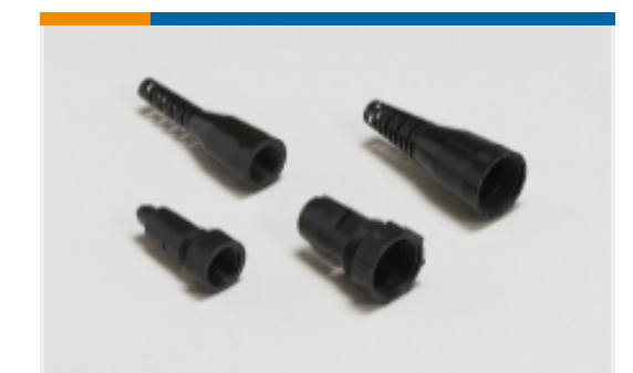
Connector Strain Relief(5)