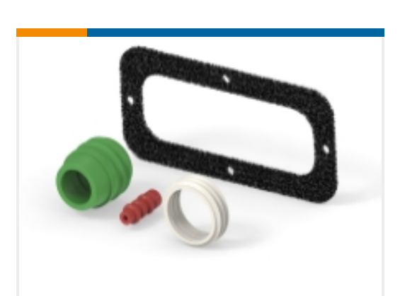
Connector Seals & Cavity Plugs(11)