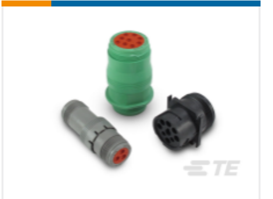
TE Part # CAT-H3910-CH8172 DEUTSCH HD10 Housings