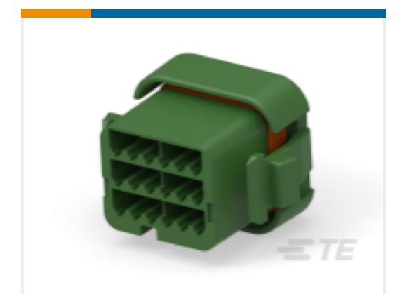
TE Part # DTV06-18SC PLG, 18P, GRN, N, C