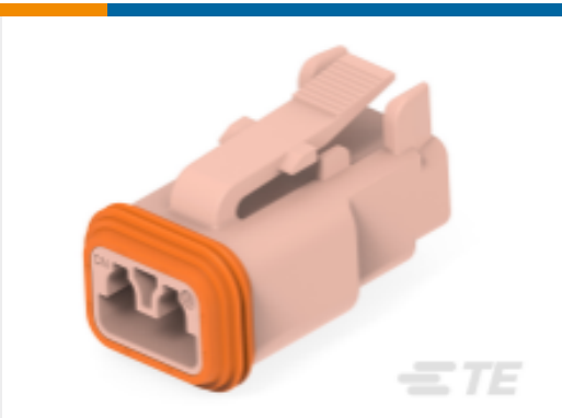
TE Part # CAT-J41-DDCC DEUTSCH DT Color Connectors