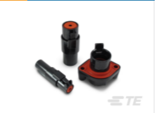
TE Part # CAT-D48-PCH8172 DEUTSCH DTHD Housings