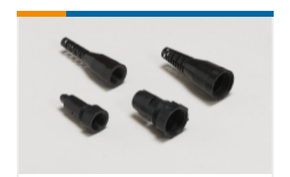
Connector Strain Relief(5)