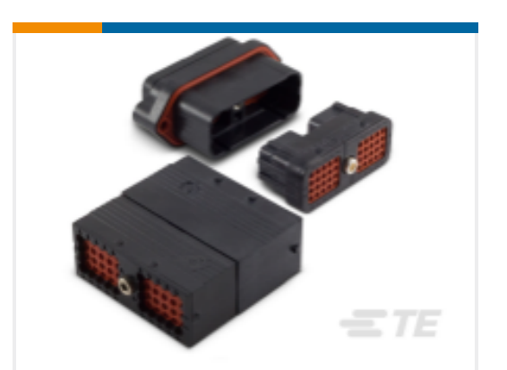
TE Part # CAT-D799-CH8172 DEUTSCH DRC Housings