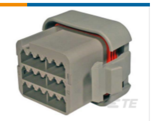
TE Part # DTV06-18SA PLG, 18P, GRY, N, A