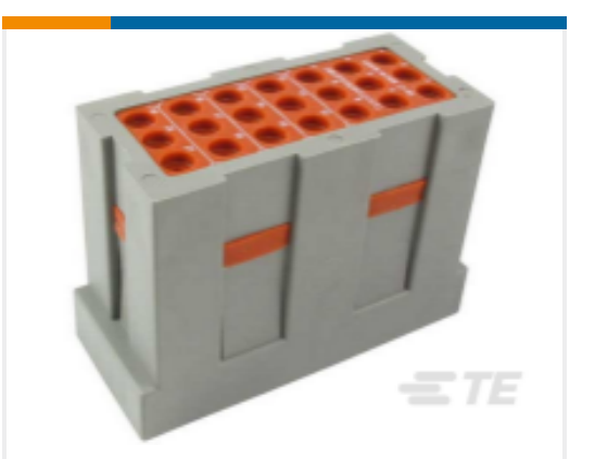
TE Part # HDFB-16-06S MODULE, FEEDBACK, 21P, GRAY, SZ16, SOC