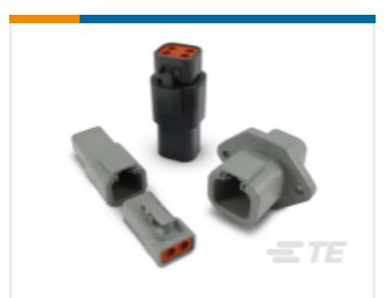
TE Part # CAT-D486-CH8172 DEUTSCH DTP Housings