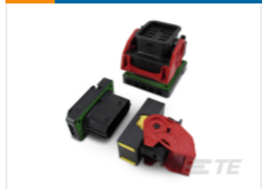
TE Part # CAT-ST858-CH8172 DEUTSCH Strike Housings