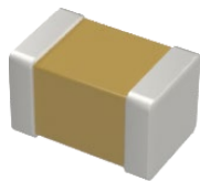
AC series construction

This product specification is applied to Multi-layer Ceramic Capacitor used for Automotive application .