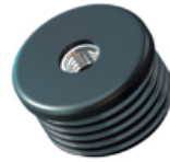
Metal Threaded Insert