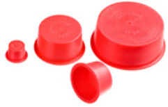
Tapered Caps and Plugs