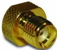
SMA Terminator Jk 50 Ohm Without Chain 132361