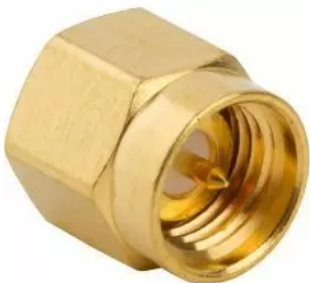
SMA Terminator PL 50 Ohm Without Chain 901-10106