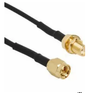
SMA Straight Plug to SMA Straight Plug RG-142 50 Ohm 102 inches 135101-07-102