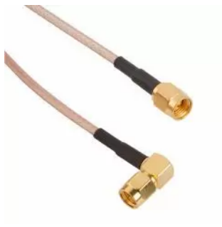
SMA Right Angle Plug to SMA Straight Plug RG-316DS 50 Ohm 18 inches 135103-03-18.00