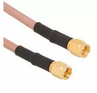
SMA Straight Bulkhead Jack to SMA Straight Plug LMR-200 50 Ohm 750 mm ARC 095-902-506M075