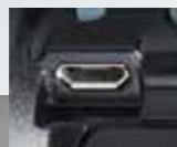
(USB Micro Type-B)