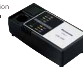
Quick battery charger EY0L11