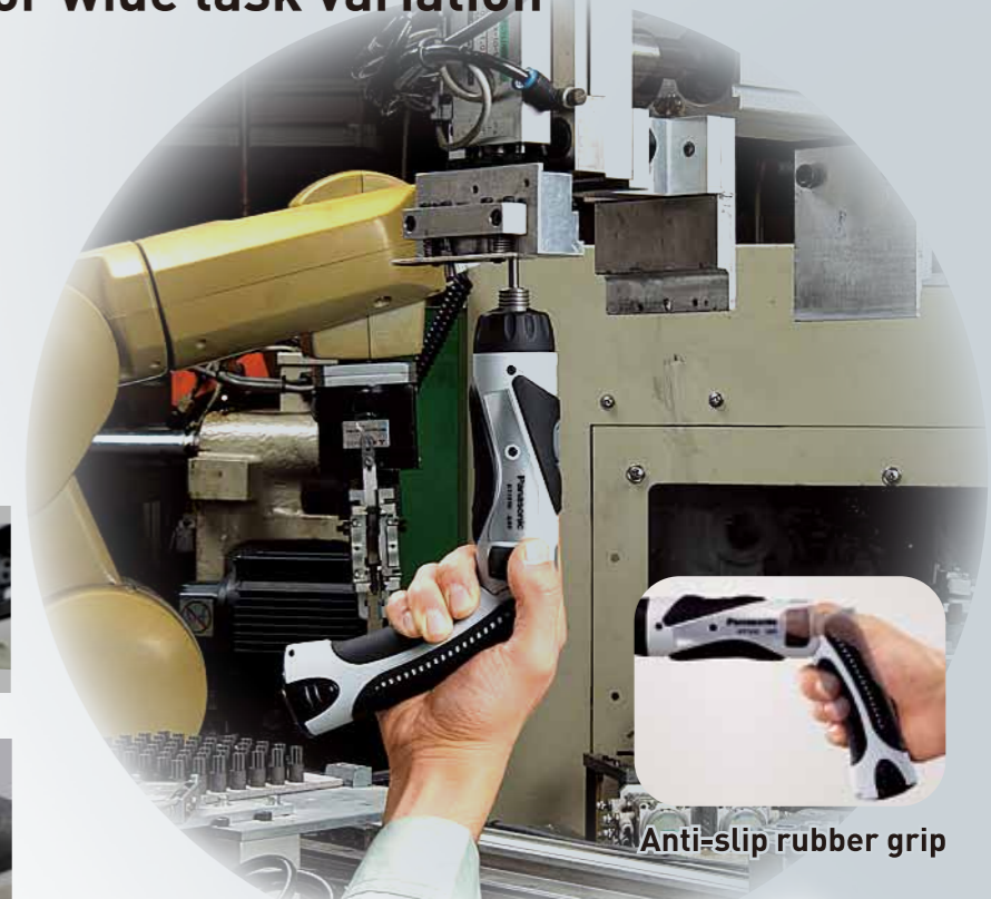
Anti-slip rubber grip