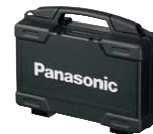
Sturdy case with bit / fastener storage

*Bits and screws are not included in the kit.