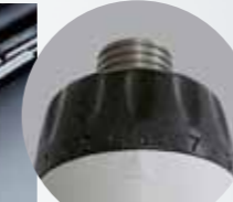
Built-in auto shut-off circuit