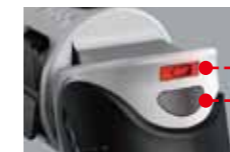
Low battery indicator