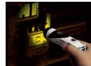
LED on/off switch