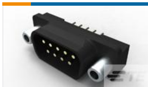
TE Part #5745071-2 HD-20 PLUG 9P VERT FFSCRLK