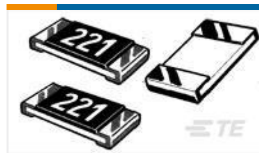
TE Part #2176070-6 3521 16R 1% 2W