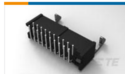
TE Part #2-1761607-6 IDC LOW PRO HDR 16P RA LG LAT