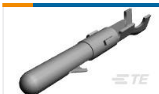
TE Part #61174-5 CMNL PIN L/P AUNIBR