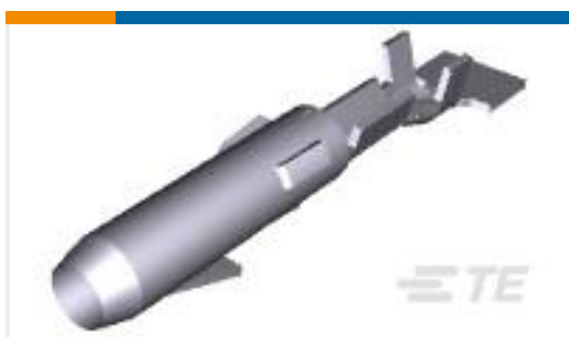
TE Part #61173-5 CMNL SOK 30-22 AUNIBR L/P