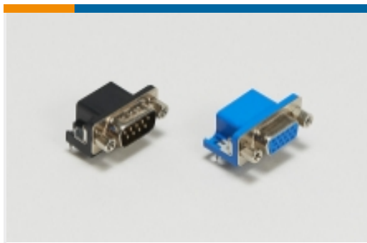
PCB D-Sub Connectors(353)