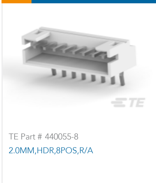
TE Part # 440055-8 2.0MM,HDR,8POS,R/A