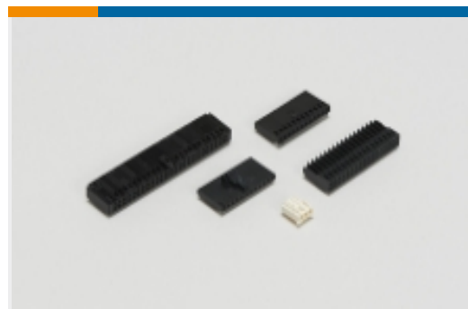
Wire-to-Board Connector Assemblies & Housings(134)