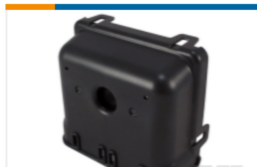
TE Part #4828-007-8605 BKSHL, 86P, BLK, VERTICAL, DRCP