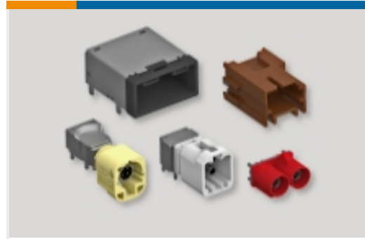
Data Connectivity Headers(2)