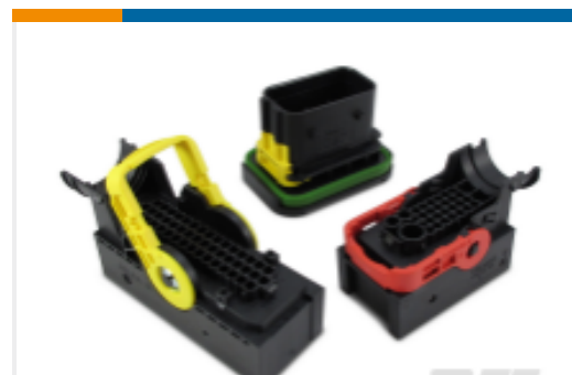
TE Part #2-2112162-1 LEAVYSEAL Connector Housings