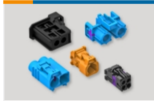
Data Connectivity Housings(3)