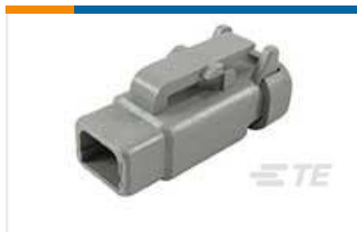
TE Part #DTM06-2S-E003 PLG, 2P, GRY, N, CAP