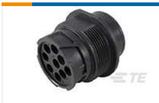
TE Part #HD10-9-96PE-B025 RECP ASM