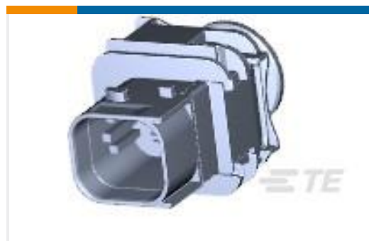
TE Part #2-1703773-1 6POS,TAB 1.6X0.6,PIN HSG,ASSY