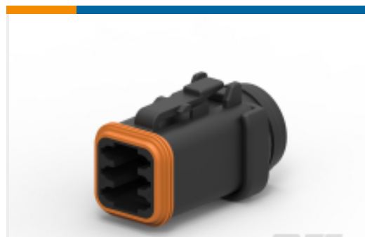
TE Part #DT06-6S-LC01 PLG, 6P, BLK, E, SEAL RET,DIN BKSHL ADPT