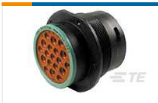
TE Part #HDP24-24-19SN REC, 19P, BLK, N, 12/16, S