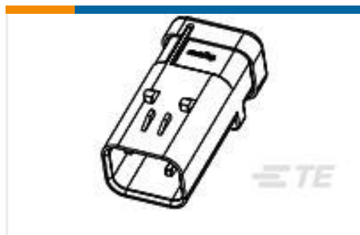
TE Part #776536-2 AS16,CAP ASSY,ST,04P,E SEAL,CODE B