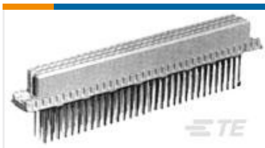
TE Part #1-148057-5 096 EURO TYP C RECP 13MM ASSY