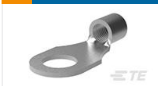
TE Part #330301 TERMINAL,SOLIS R 2 10