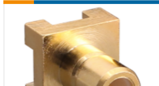
TE Part #CONSMB001-SMD-G SMB Jack 50 Ohm PCB Surface Mount