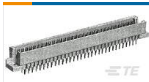
TE Part #5650908-5 ASSY,PIN,EUROCARD,TYPE R,LEAD-