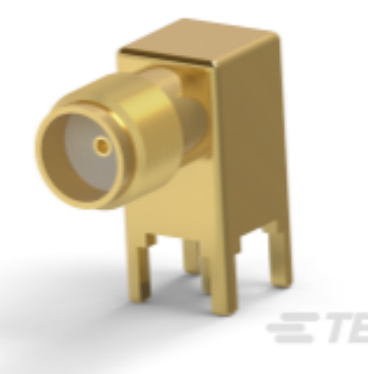
TE Part #5-1814400-2 SMA R/A PCB Skt GZD