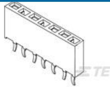
TE Part #1-215297-6 16P HV100 REC CON. TE, 7.0MM