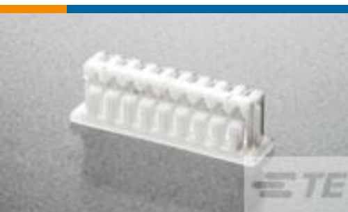
TE Part #1-440146-2 1.25mm WTB Socket,Housing,12p