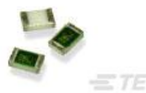
TE Part #6-1879212-7 CPF 0402 10R7 0.1% 25PPM 1K RL