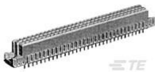
TE Part #535043-5 096 EURO TYPE C RECEPT ST ASSY