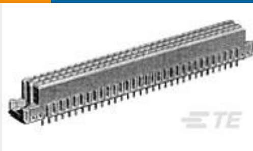
TE Part #5536412-4 ASSY,RECEPT,EURO,TYPE C,LEAD- FREE,96,.18