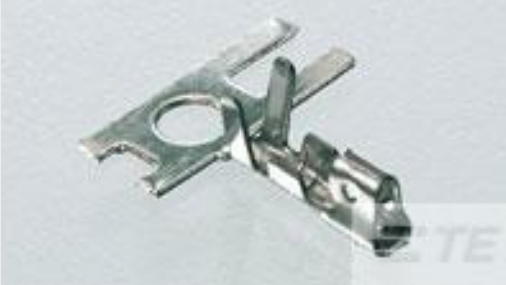
TE Part #1735801-1 2.0mm,Crimp>Contact