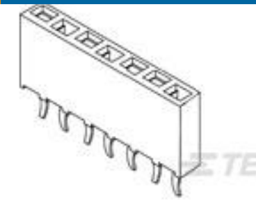
TE Part #1-215297-2 12P HV100 REC CON. TE, 7.0MM