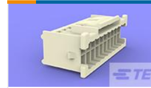
TE Part #1-1969540-8 HOUSING, PLUG, 18P,DUAL ROW, EP2.5