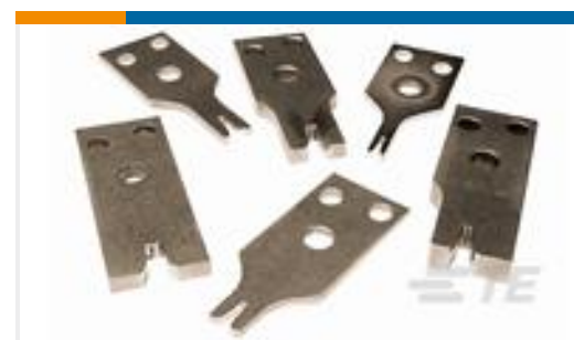
TE Part #6-683454-4 CRIMPER, INSULATION \"O\"(.110\")