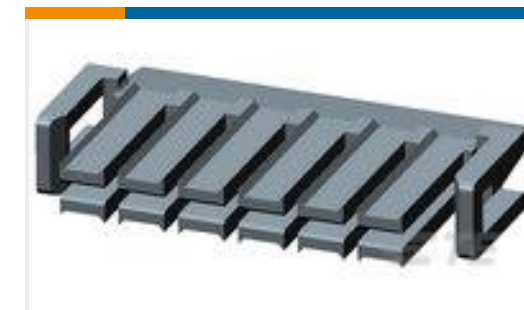
TE Part #1-1969541-8 RETAINER, TPA, DUAL ROW, EP2.5