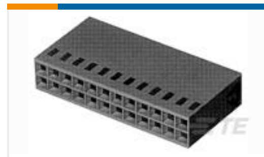
TE Part #144095-2 HOUSING MODU IV 2X3 P NEUTRAL