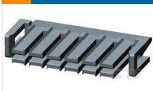
TE Part #1-1969541-4 RETAINER, TPA, DUAL ROW, EP2.5