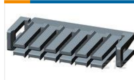
TE Part #2-1969541-2 RETAINER, TPA, DUAL ROW, EP2.5