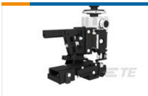
TE Part #2151582-1 OCEAN_2.0_Applicator-S-110F1650-RSM