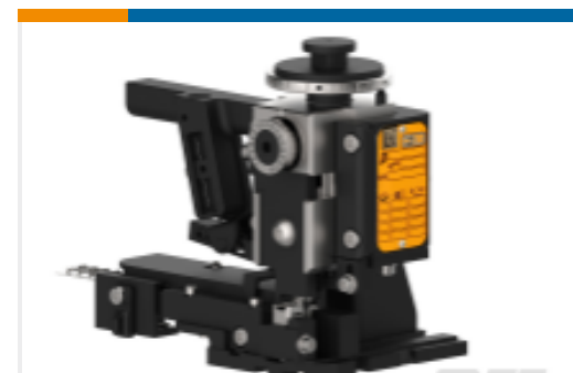
TE Part #2836077-1 OCEAN_2.0_Applicator-S-070F1000-RSM