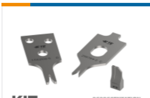
KIT TE Part #7-2266813-7 OCEAN_2.0_SPARE_PART_KIT-055F062F