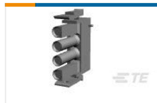
TE Part #926298-5 UN-MNL STECK-GEH 4P