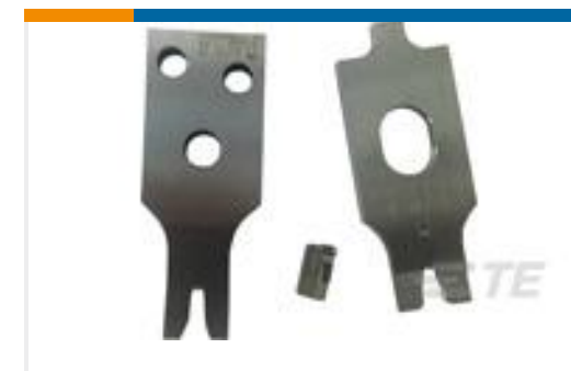
TE Part #7-2150373-7 OCEAN-055F080F-CRIMPTOOLINGKIT