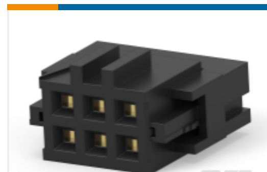
TE Part #215882-6 AMP-LATCH MIL TYPE RCPT CONNECTOR