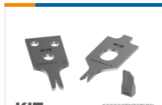
KIT TE Part #7-2837932-7 OCEAN_2.0_SPARE_PART_KIT-062F0910