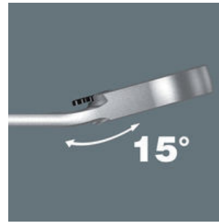
Tilted ratchet end

The ratchet end is tilted at 15° to the tool axis, making application of the tool in confined spaces much easier.