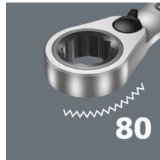
Fine tooth mechanism

The ratcheting feature at the ring end boasts an exceptional, fine tooth mechanism - 80 teeth in all - which provides greater flexibility, even in very confined workspaces.