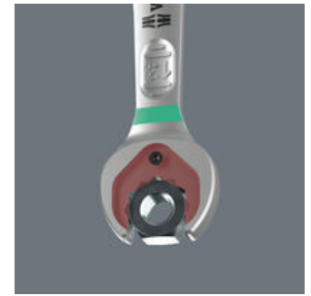
Ring ratchet spanner Joker 6000

The Joker's holding function means that nuts and bolts can be held in the jaw and easily positioned where they are needed. Fastening on to the thread can then be done quickly and safely, thanks to the innovative special stop-plate which holds the fastener. No more time-wasting searches for dropped nuts and bolts! After applying and positioning the nut or bolt, fastening can begin immediately - no additional tools required.