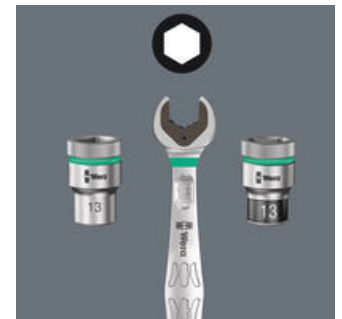
"Take it easy" tool finder

Take it easy tool finder system - with profile and size colour-coding for quick and easy tool selection. Colour-coded system for hexagon drive screws (L-Keys, Zyklop bit sockets), external hex drive screws and nuts (Joker wrenches, Zyklop sockets and Zyklop bit sockets with holding function), and TORX® drive screws (L-Keys, Zyklop bit sockets).