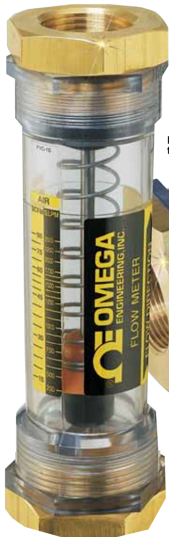
FL-510, shown smaller than actual size.