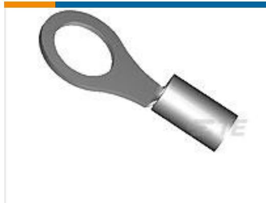
TE Part #323745 TERMINAL, SOLIS R HT 12-10 8