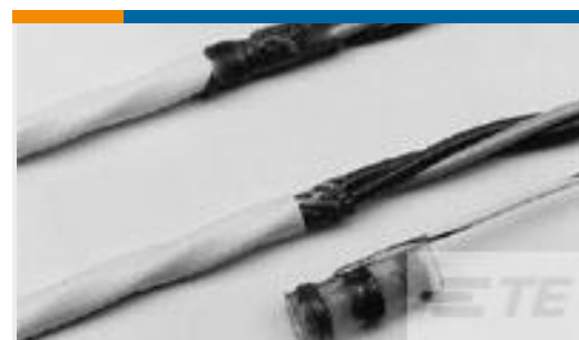
TE Part #CB3127-000 D-1744-03-LF