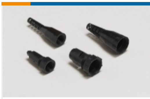
Connector Strain Relief(2)