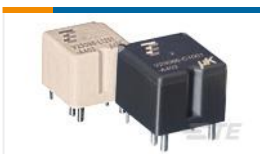
TE Part #1393280-6 V23086C1001A403