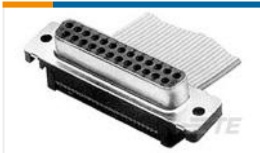
TE Part #1658606-1 50 POS HDF RCPT, MS, LEAD FREE