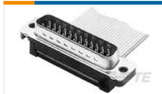
TE Part #1658607-1 50 POS HDF PLUG, MS, LEAD FREE