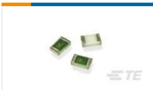
TE Part #1676363-2 RN 0805 4K99 0.1% 10PPM 1KRL