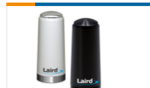
TE Part #TRA6927M3PW-001 OMNI,DB,Ph,698/1710 MHz WHT,3 dBi,100W,