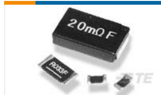
TE Part #3-1879378-1 TLR 2512 1.0W R0025 1% 150PPM 2K RL