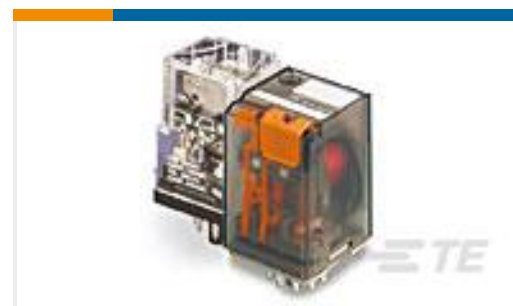
TE Part #4-1393104-4 KRPA-11DG-125=KRPA