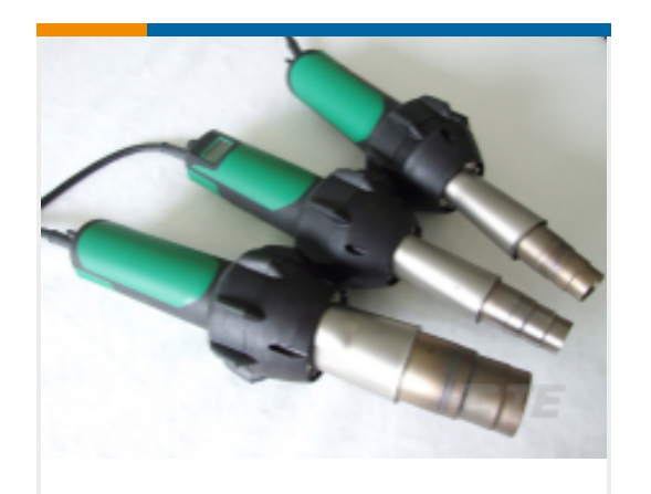
TE Part # EG1114-000 CV1981-ST-230V1600W-EU