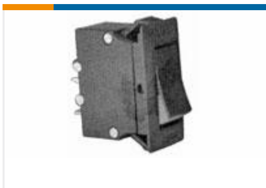
TE Part #4-1423673-2 W51-A152A1-20=CKTBKR,THERM, ROC