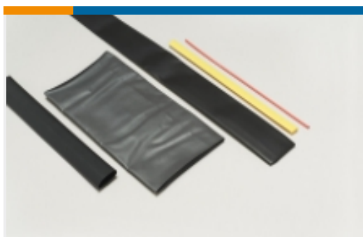
Heat Shrink Tubing(59)