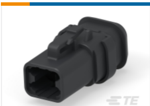
TE Part #DTP06-4S-EE01 PLG, 4P, BLK, N, XCAP