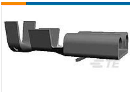
TE Part #60838-1 FF 250 REC 22-18AWG TPBR LP