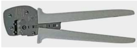
Crimping pliers for MC4 and MC4-Evo 2 (PV-CZM...)