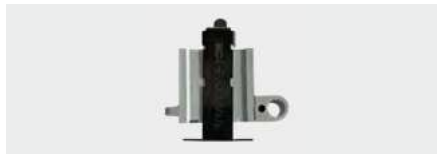
Locator (PV-LOC-MC4-EVO 2...)