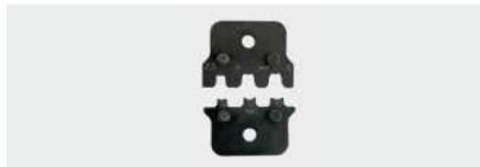
Crimping die (PV-ES-CZM...)