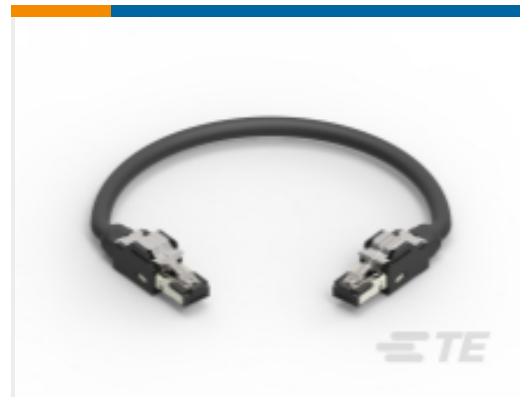
TE Part # 1-2300160-1 CA IND RJ45STR 8POS