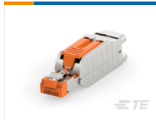
TE Part # 2383216-1 RJ45 FIELD INSTALLABLE CABLE CONN.