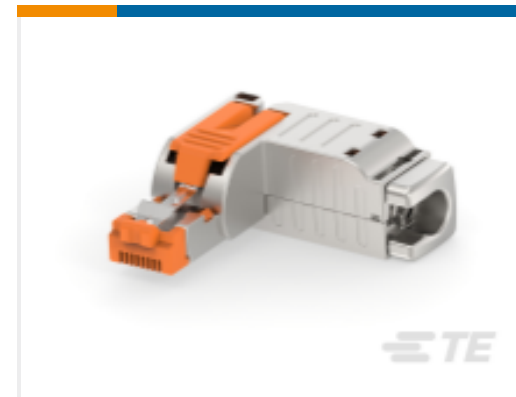
TE Part # 2383217-1 RJ45 FIELD INSTALLABLE CABLE CONN. 90