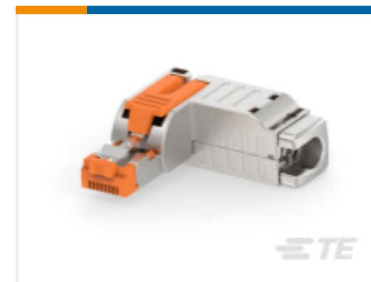
TE Part # 2383217-1 RJ45 FIELD INSTALLABLE CABLE CONN. 90