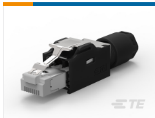
TE Part # 2120892-1 RJ45 CONNECTOR CAT6A, IP20 PLUG