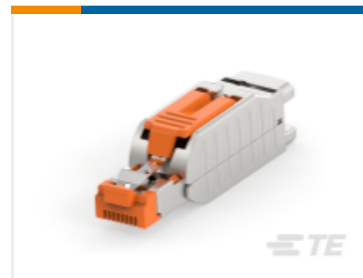
TE Part # 2383216-1 RJ45 FIELD INSTALLABLE CABLE CONN.