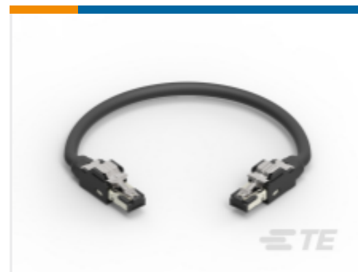
TE Part # 1-2300160-1 CA IND RJ45STR 8POS