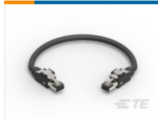
TE Part # 1-2300160-1 CA IND RJ45STR 8POS