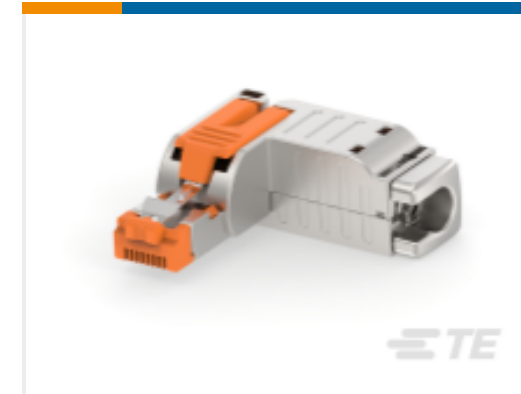
TE Part # 2383217-1 RJ45 FIELD INSTALLABLE CABLE CONN. 90