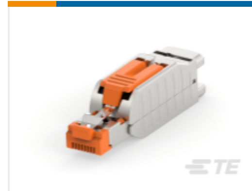
TE Part # 2383216-1 RJ45 FIELD INSTALLABLE CABLE CONN.