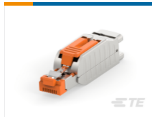
TE Part # 2383216-1 RJ45 FIELD INSTALLABLE CABLE CONN.