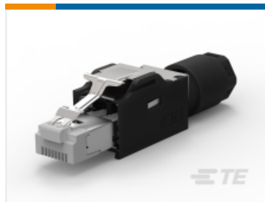
TE Part # 2120892-1 RJ45 CONNECTOR CAT6A, IP20 PLUG