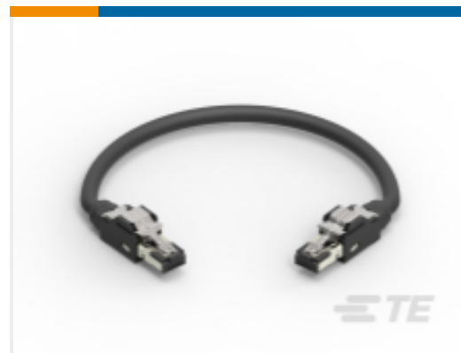
TE Part # 1-2300160-1 CA IND RJ45STR 8POS