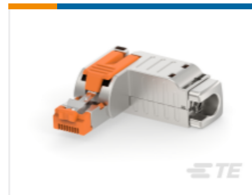
TE Part # 2383217-1 RJ45 FIELD INSTALLABLE CABLE CONN. 90