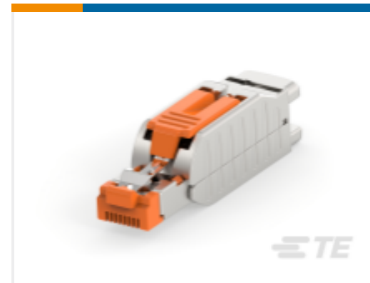
TE Part # 2383216-1 RJ45 FIELD INSTALLABLE CABLE CONN.