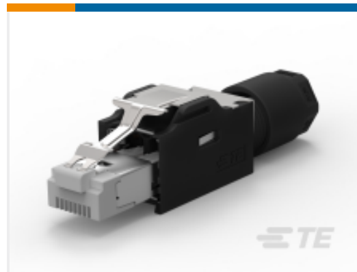
TE Part # 2120892-1 RJ45 CONNECTOR CAT6A, IP20 PLUG