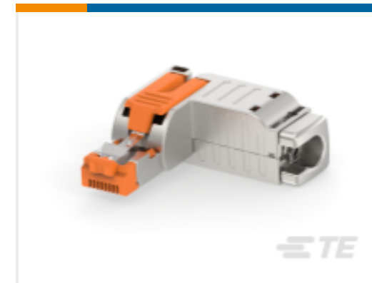
TE Part # 2383217-1 RJ45 FIELD INSTALLABLE CABLE CONN. 90