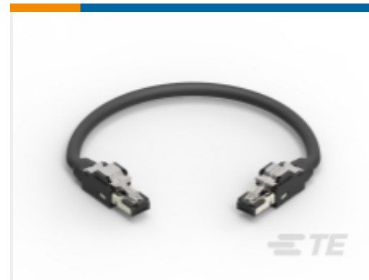
TE Part # 1-2300160-1 CA IND RJ45STR 8POS