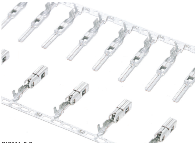
SICMA 2.8 Female & Male Terminals