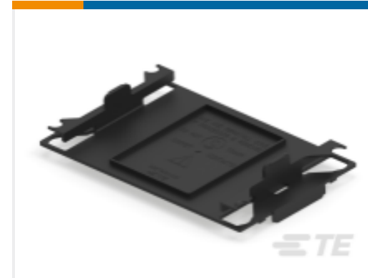
TE Part #1-2351053-3 LGA4677/LGA4710 SOCKET COVER