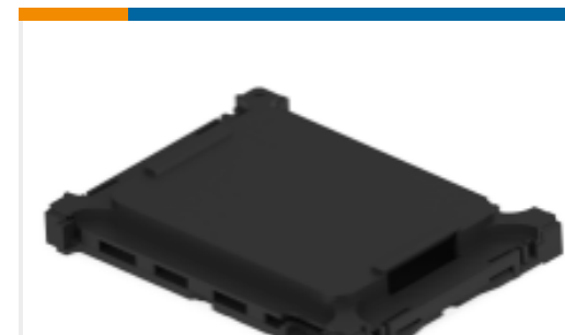
TE Part #1-2397198-1 SOCKET 4710 FOR ODM