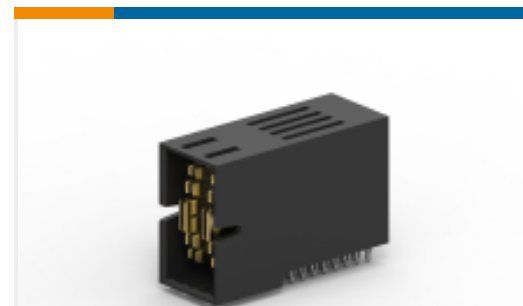
TE Part #2204443-1 MULTI-BEAM HD R/A PLUG 2P