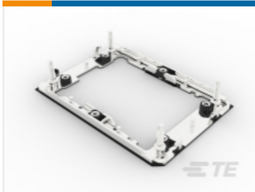
TE Part #2-2330550-1 SOCKET P4 BOLSTER PLATE ASSY, W /O COVER