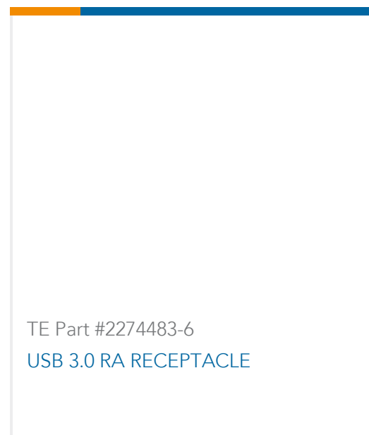
TE Part #2274483-6 USB 3.0 RA RECEPTACLE