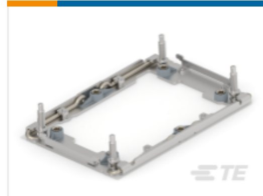
TE Part #2405568-1 LGA4710 TFLM ASSEMBLY W/O COVER