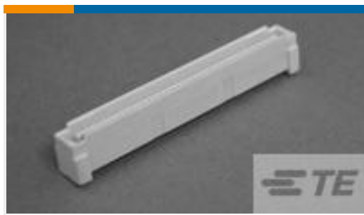
TE Part #6123001-1 0.8FH,P08H.5,040,30/Sn,TR,SC