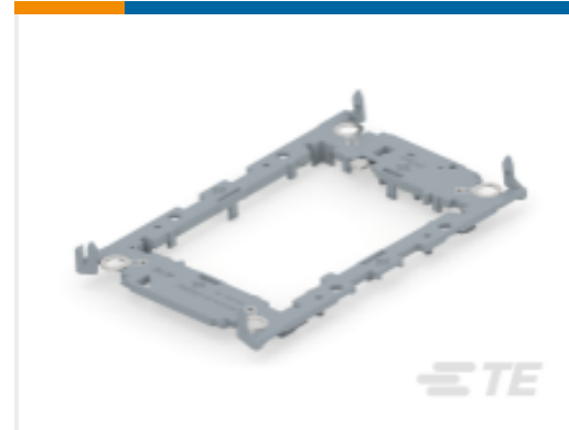
TE Part #2405570-2 LGA4710 E2B CARRIER ASSY