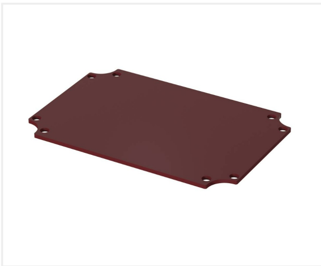
BOV M 1209 Alu Order no.: 48802202