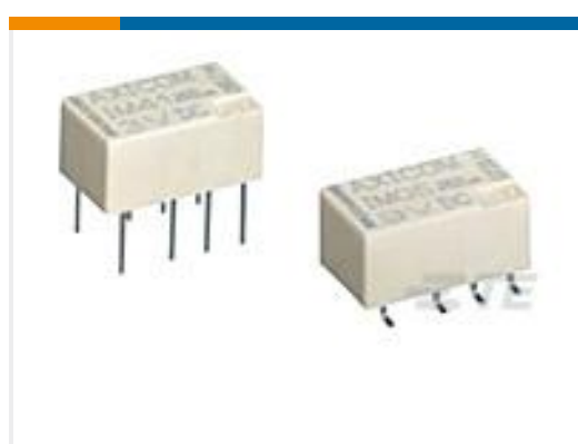
TE Part #2-1462039-8 IM22TS=IM RELAY 50mW 4.5V