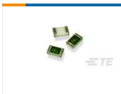
TE Part #1-1879061-5 CPF 0402 33R 0.1% 25PPM 5K RL