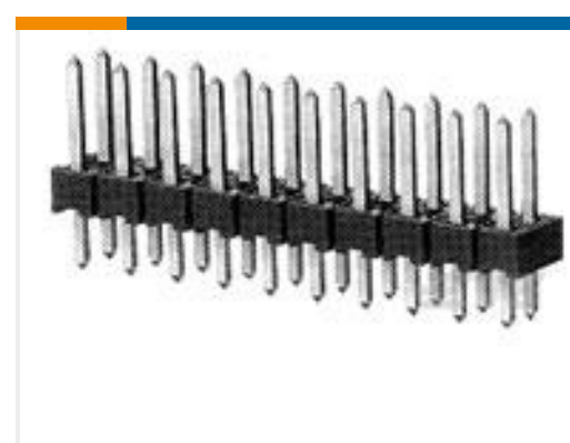
TE Part #826942-5 5P MOD2 STIFT LEI