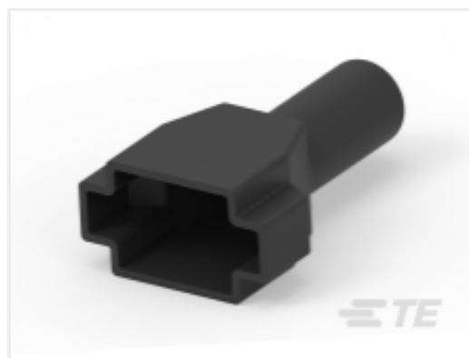
TE Part #DT8S-BT-BK BOOT, 8P, PLG, ST, BLK