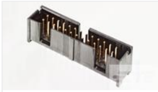
TE Part #1761681-5 IDC LOW PRO HDR 14P VERT HT BLACK