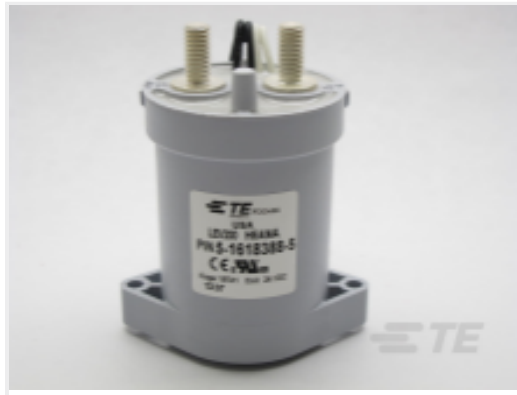
TE Part # 9-1618392-2 LEV200HLANA=RELAY, SPST-NO