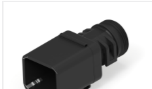
TE Part #1011-245-0805 BKSHL, 8P, BLK, REC, ST, NW8.5/10/13