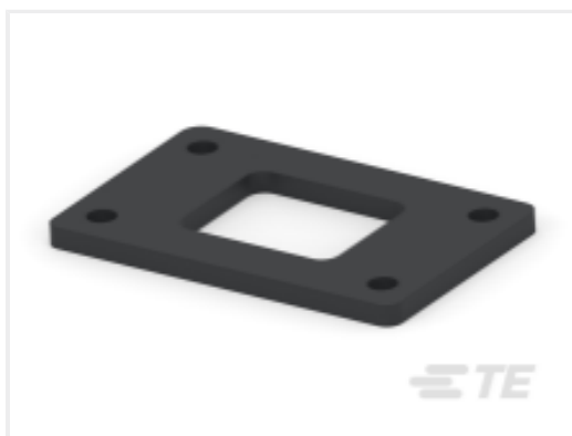
TE Part #DT8P-L012-GKT GASKET, 8P, BLK, DT/DTM