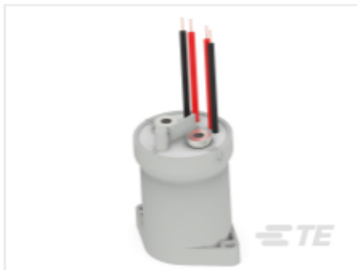
TE Part # 6-1618415-3 LEV100H5FNG = CONTACTOR WITH AUX SPST