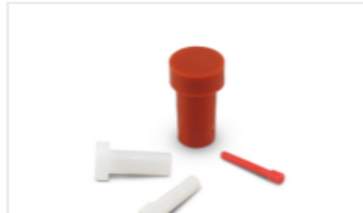
TE Part #114019-ZZ DEUTSCH Sealing Plugs