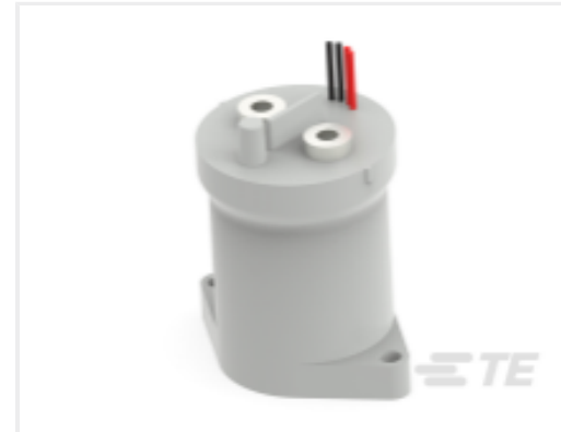
TE Part # 6-1618415-2 LEV100H4FNG=CONTACTOR 12V, AUX SPST,15"