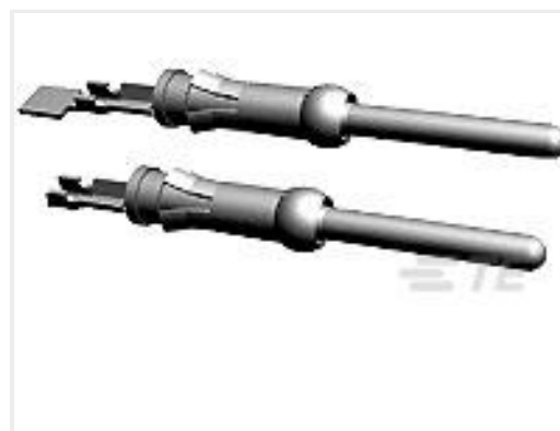
TE Part #66566-7 III+ PIN,24-20,TIN,LP