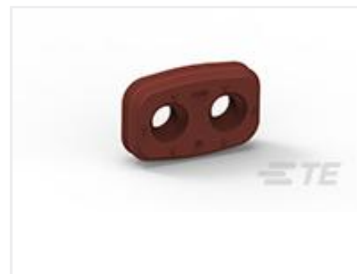
TE Part #1587826-2 CABLE SEAL, SIZE B, HVA280-2PI