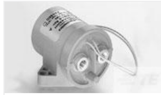
TE Part #4-1618391-0 LEV100A4ANH=RELAY, SPST-NO, 12VDC