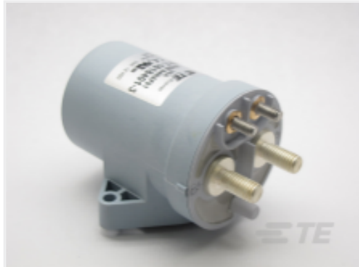
TE Part #3-1618389-2 LEV200H4ANF=RELAY, SPST-NO