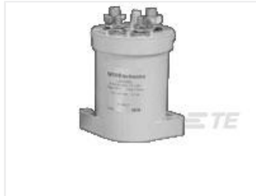
TE Part # 3-1618389-7 LEV100A4ANG=RELAY, 12Vdc SPST-NO