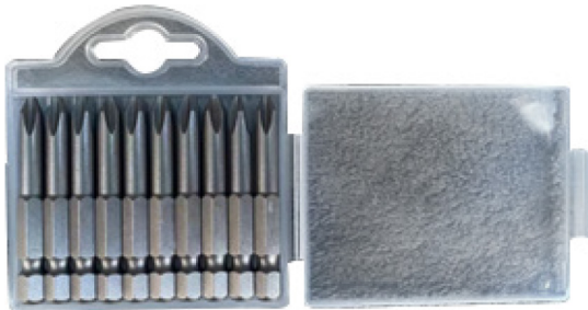
Driver Bit Set