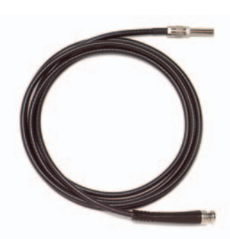
75\Omega BNC (M) to Mini-weco Cable 6515-96