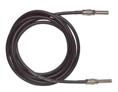
Mini-weco Plug / Plug Patch Cord 6502-96