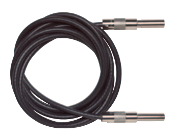
Weco Plug / Plug Patch Cord 6507-96