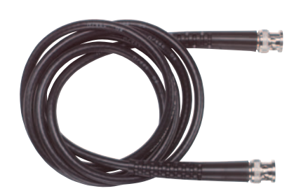
Rugged 75 \Omega BNC Plug / Plug, 3ft to 25ft (0.9m to 7.6m )