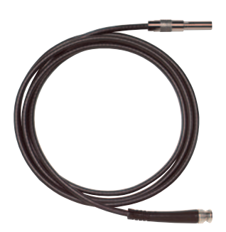
75\Omega BNC (M) To Standard Weco Cable 6516-96