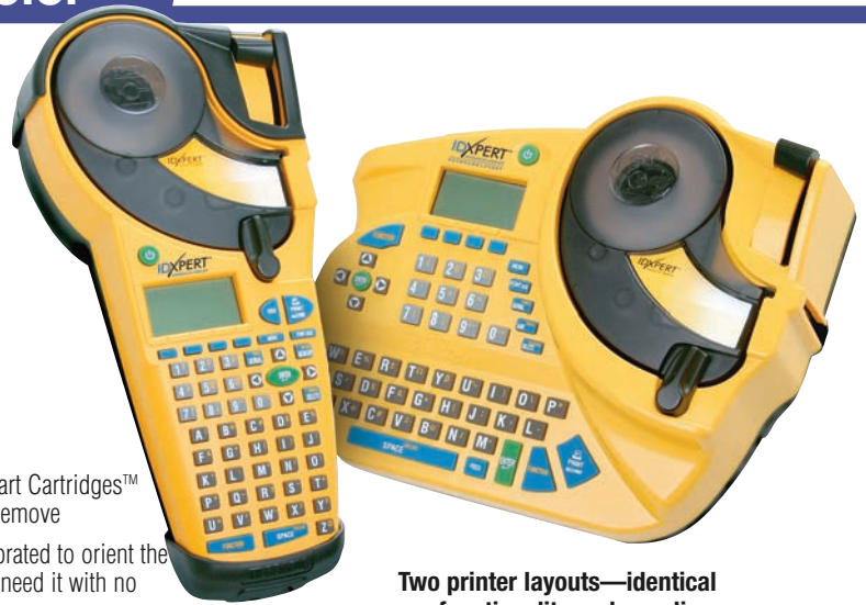
Two printer layouts—identical functionality and supplies.