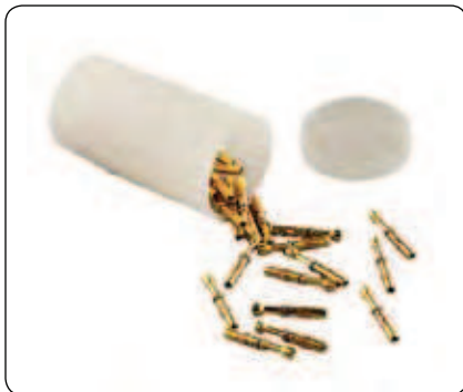
50 pcs bulk packing (standard)