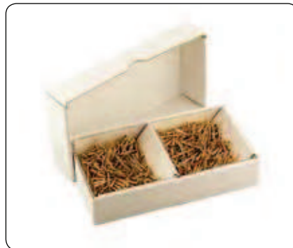
1000 pcs bulk packing