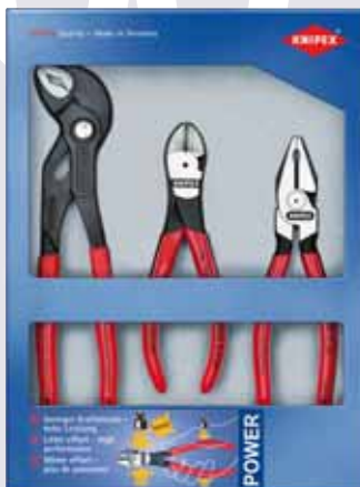
Modell 00 20 10: