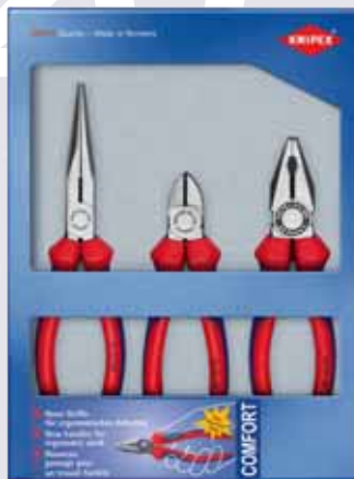
Modell 00 20 11: