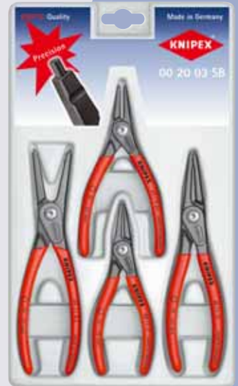
00 20 03 SB