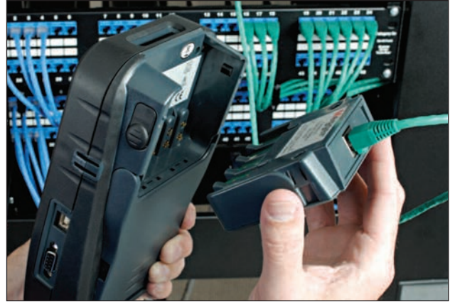
SCT Series adapter employs new "connector-less" adapter technology.

The SCT Series speeds the user through link diagnosis with powerful diagnostic tools found only on the Megger SCT. The instrument pinpoints the distance to link disturbances on each measured pair and displays this data in multiple helpful formats. After completing a certification test the user can choose to generate and display diagnostic results. Diagnostic wiremap displays the length to an open or short on each pair. Diagnostic TD NEXT and TD Return Loss measurements quickly and accurately calculate the distance to and the strength of all disturbances on each measured pair on a percentage scale, where values exceeding 100% are an indication of a link failure. Summary TD NEXT and TD Return Loss display the distance and strength of the single worst disturbance for pinpointing the worst fault. Detailed TD NEXT and TD Return Loss display the distance and strength of each pair's worst case disturbance for quickly pinpointing one or more faults. This is highly useful for confirming connector or cable failures. Graphic TD NEXT and TD Return Loss display every pairs disturbances vs. distance on a graph for pinpointing all possible faults. This is highly useful for diagnosing all possible link failures.