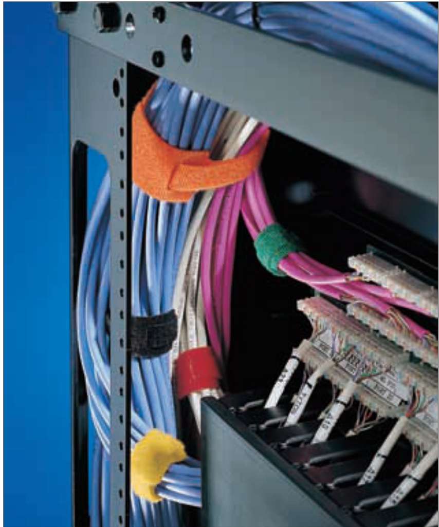
There is a wide range of private or office applications for the TEXTIE®-Series.

Perfect for use in temporary installations such as theatre stage construction or prototype cable harnesses.