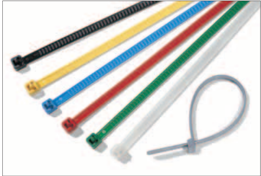
The LR55 cable ties are reusable and ideal for colour coding.

These releasable and reusable ties are ideal where temporary installation or the addition or removal of cables is required, for example: logistic identification (colour coding), packaging industries, cable harness manufacturing.