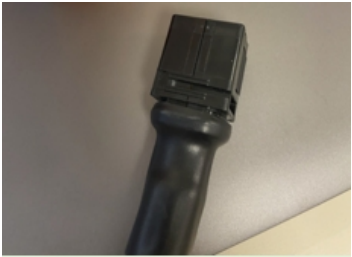
REFER NOTE 3