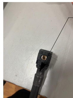
REFER NOTE 3