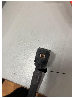
REFER NOTE 3