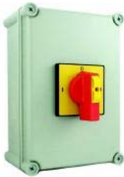
Rotary Isolator (Load Break Switch) Dimensions