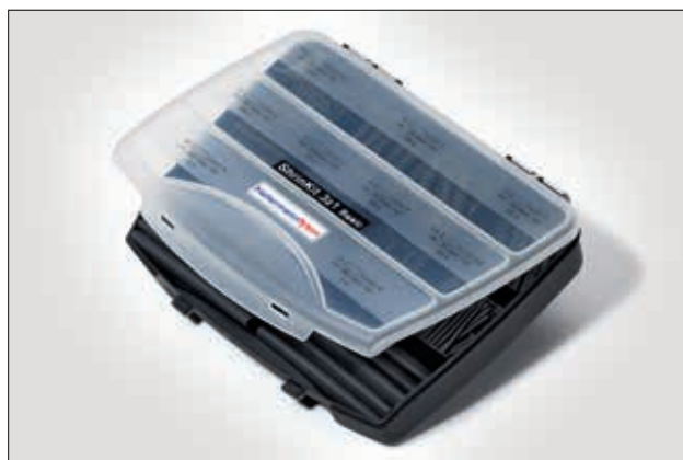
ShrinkKit 321 Basic.