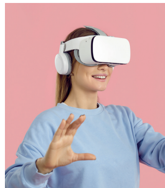
Virtual reality technology