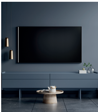
Digital and smart TV