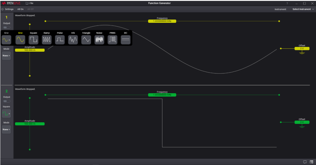
Figure 5. Select and configure your required waveform