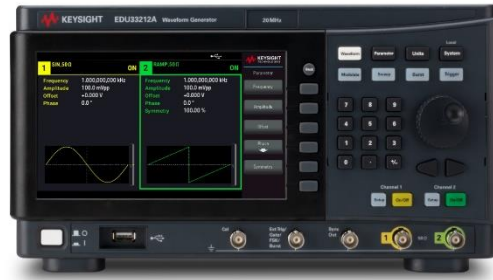
Keysight EDU33212A 20 MHz, dual-channel function/arbitrary waveform generator