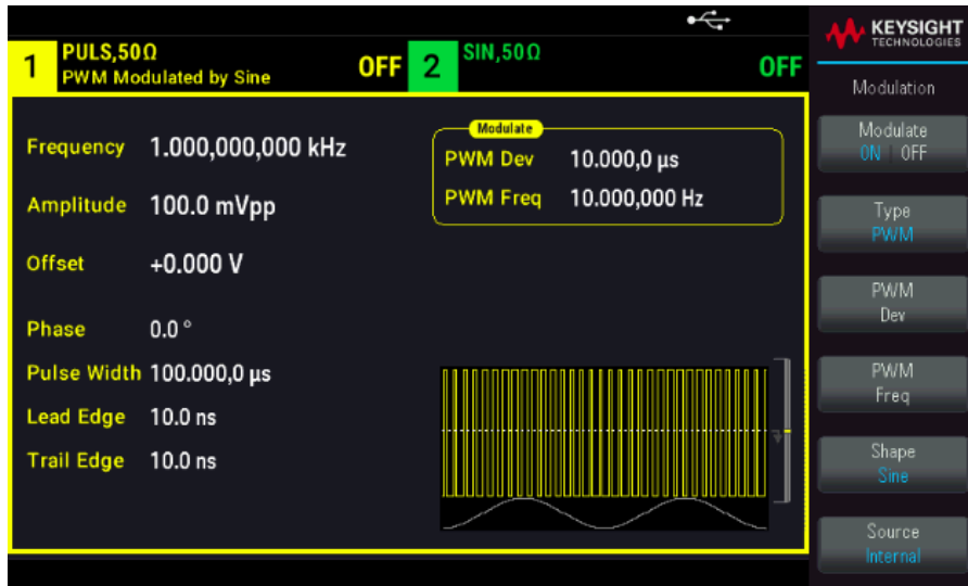
Figure 3. PWM modulated with standard sine wave