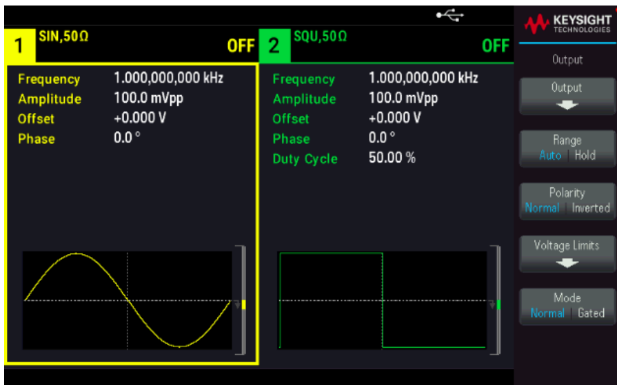
Figure 2. Dual-screen display of standard sine and square wave