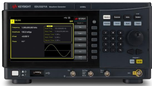
Keysight EDU33211A 20 MHz, single-channel function/arbitrary waveform generator