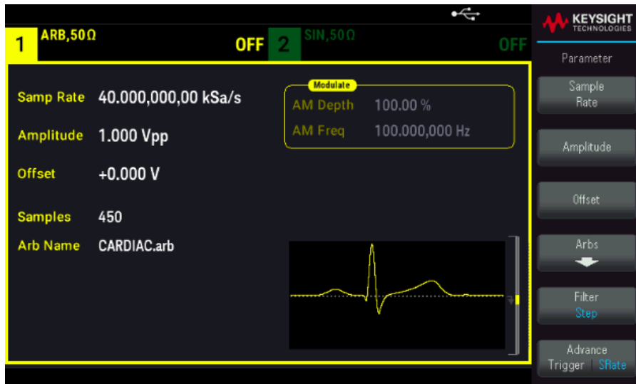
Figure 4. Cardiac specialty waveform