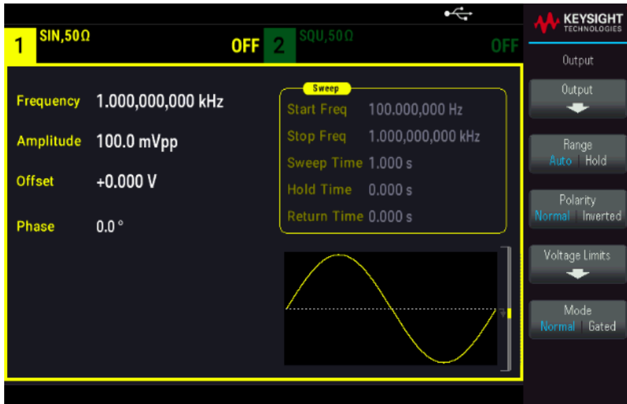
Figure 1. Standard sine wave and setting