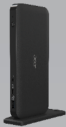
Acer USB Type-C Dock III