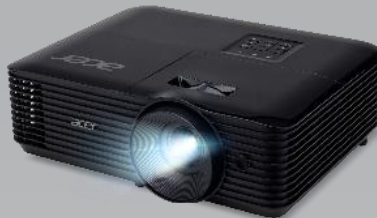
4,500 Lumens WXGA Projector X1328WKi