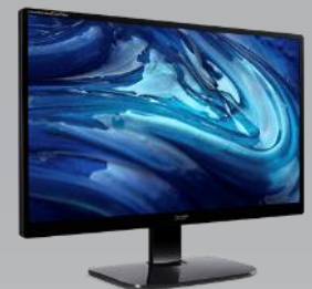
23.8" Antimicrobial 360 Monitor KE2 series