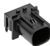
12-Circuit Sealed Wire-to-Board Header