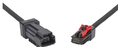
12-Circuit Unsealed Wire-to-Wire Connector and Plug