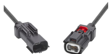
12-Circuit Sealed Wire-to-Wire Connector and Plug